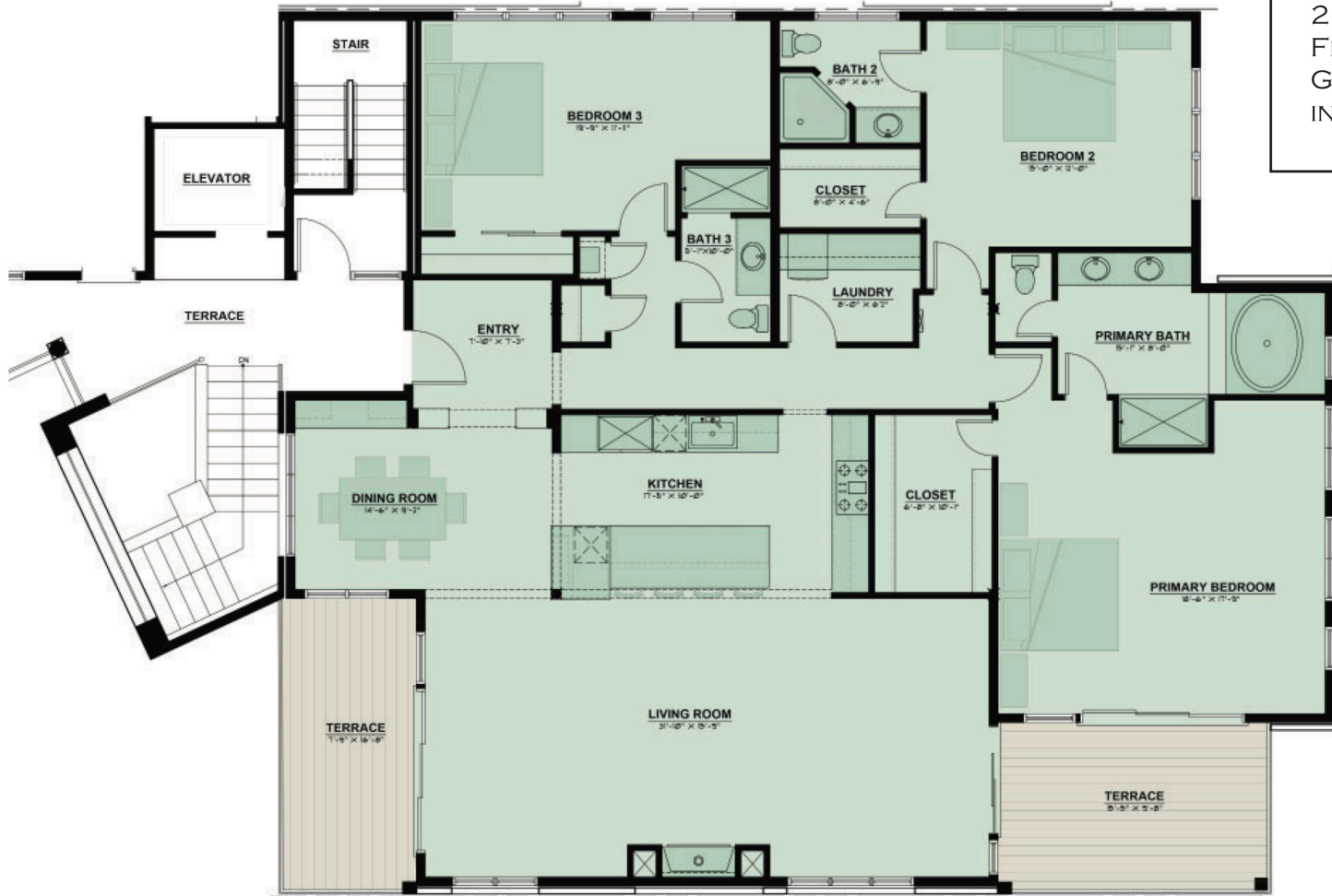
UNIT B FLOOR PLAN

2,357 SF 3 BEDROOMS 2.5 BATHS FLATIRON VIEWS FROM TERRACE GARAGE WITH 2 DESIGNATED PARKING STALLS + STORAGE